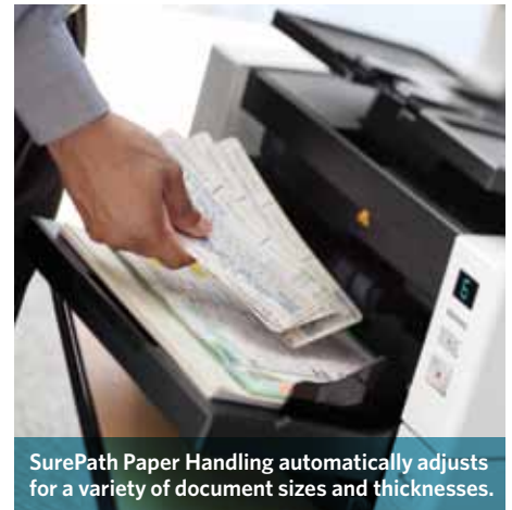
SurePath Paper Handling automatically adjusts for a variety of document sizes and thicknesses.

Optional Kodak Legal Size and A3 Size Flatbed Accessories for added capability to scan bound, oversized and fragile documents.