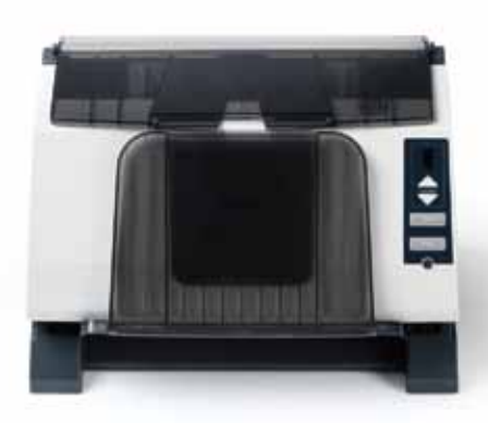
Input and output paper tray can be fold when not in use.